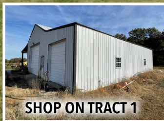
SHOP ON TRACT 1

3 Bedroom 2.5 Bath home & Shop on 1.63 Acres. This unique vinyl sided home has a spacious family room with kitchenette, vaulted ceilings, and wood burning fireplace with brick hearth. The master bedroom is on main level with ensuite. The kitchen, sunroom, laundry room, and mud room are also located on the main level. There are 2 bedrooms, walk-in closet, and half bath located upstairs. - 1.63 Acres