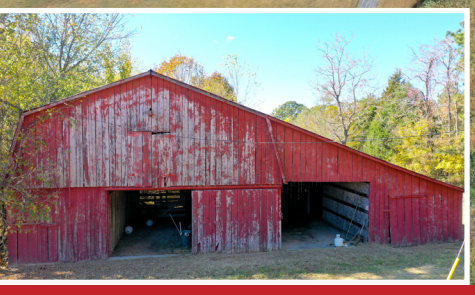
Entrance off State Route 1901