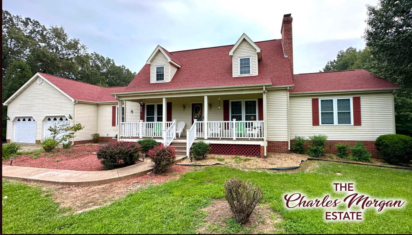
THE Charles Morgan ESTATE