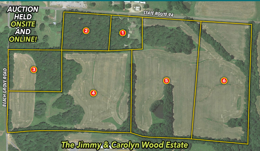
The Jimmy & Carolyn Wood Estate

TRACT 1 DETAILS: Charming 3-bedroom, 1.5-bath brick home featuring a formal living room, cozy den with built-ins, and a convenient utility room with a half bath. Enjoy the bright and inviting sunroom, perfect for relaxing. The property also boasts covered front and side porches for outdoor enjoyment. Recent upgrades include a new AC unit installed in 2024 and an updated electrical box, ensuring modern comfort and efficiency.