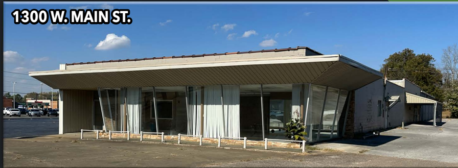
1300 W. MAIN ST.