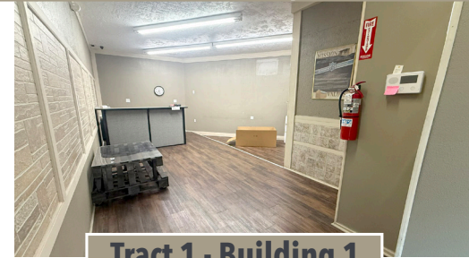
Tract 1 - Building 1