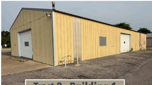
Tract 2 - Building 1