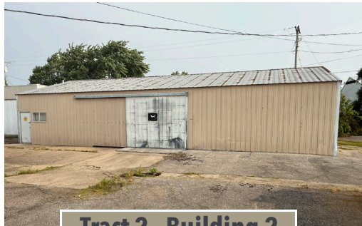
Tract 2 - Building 2