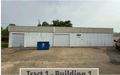
Tract 1 - Building 1

3 Commerical Buildings 84 State Route 1276 | Mayfield, KY