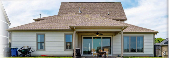
McDaniel Estates CLUB HOUSE & Amenities!

Do not miss this rare opportunity to purchase a move-in-ready home in one of Williamson County's most sought-after communities—selling absolute!