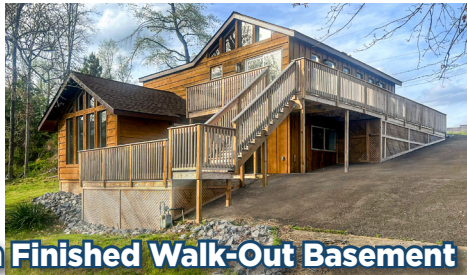
3 Bedroom, 2 Bath Home with Finished Walk-Out Basement